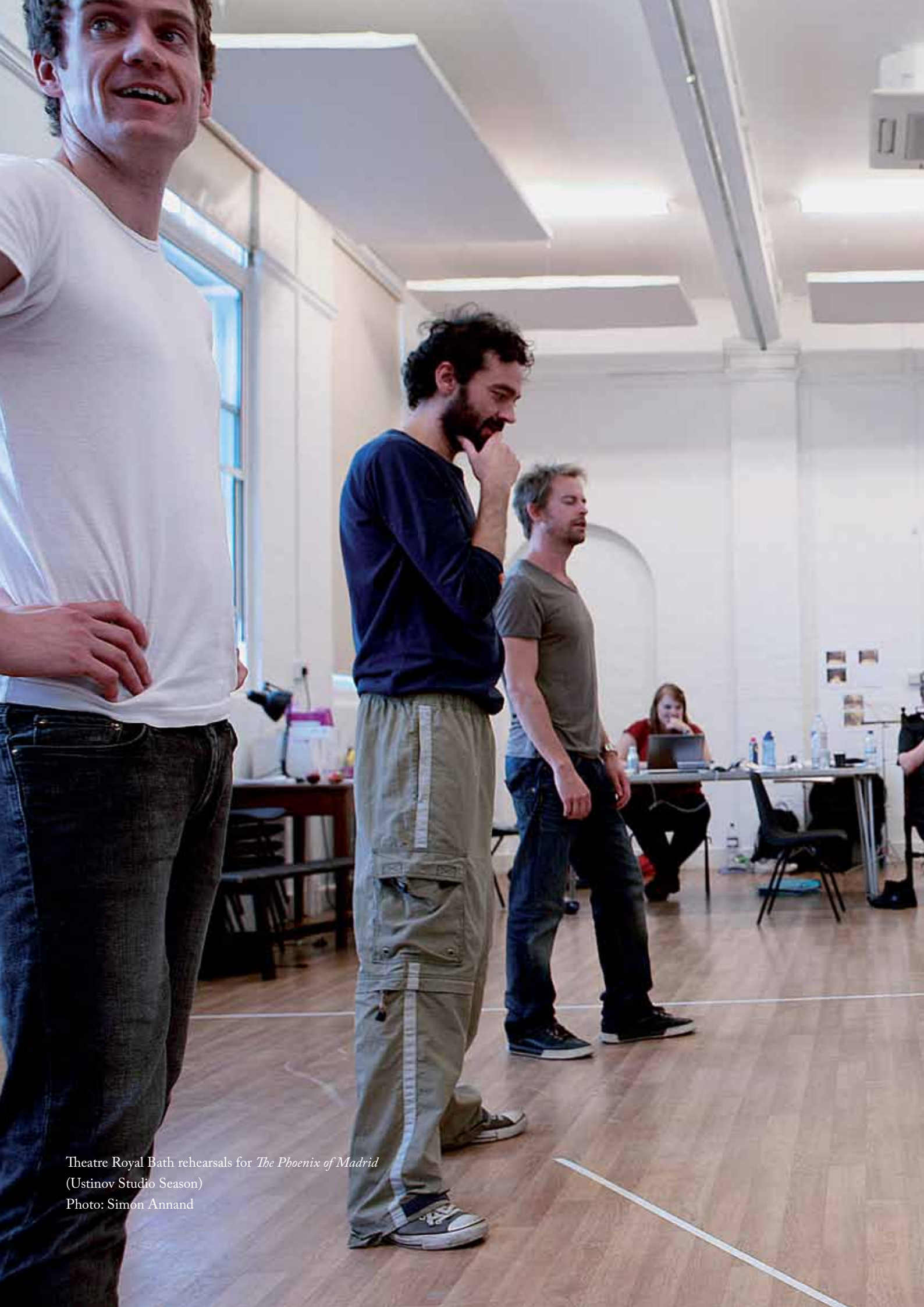
Theatre Royal Bath rehearsals for The Phoenix of Madrid (Ustinov Studio Season)