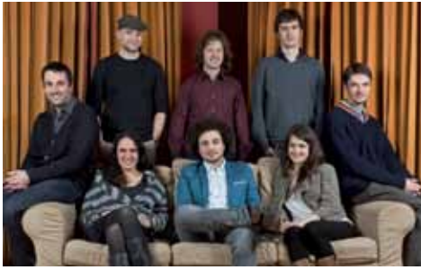
Take Five Edition VII Participants