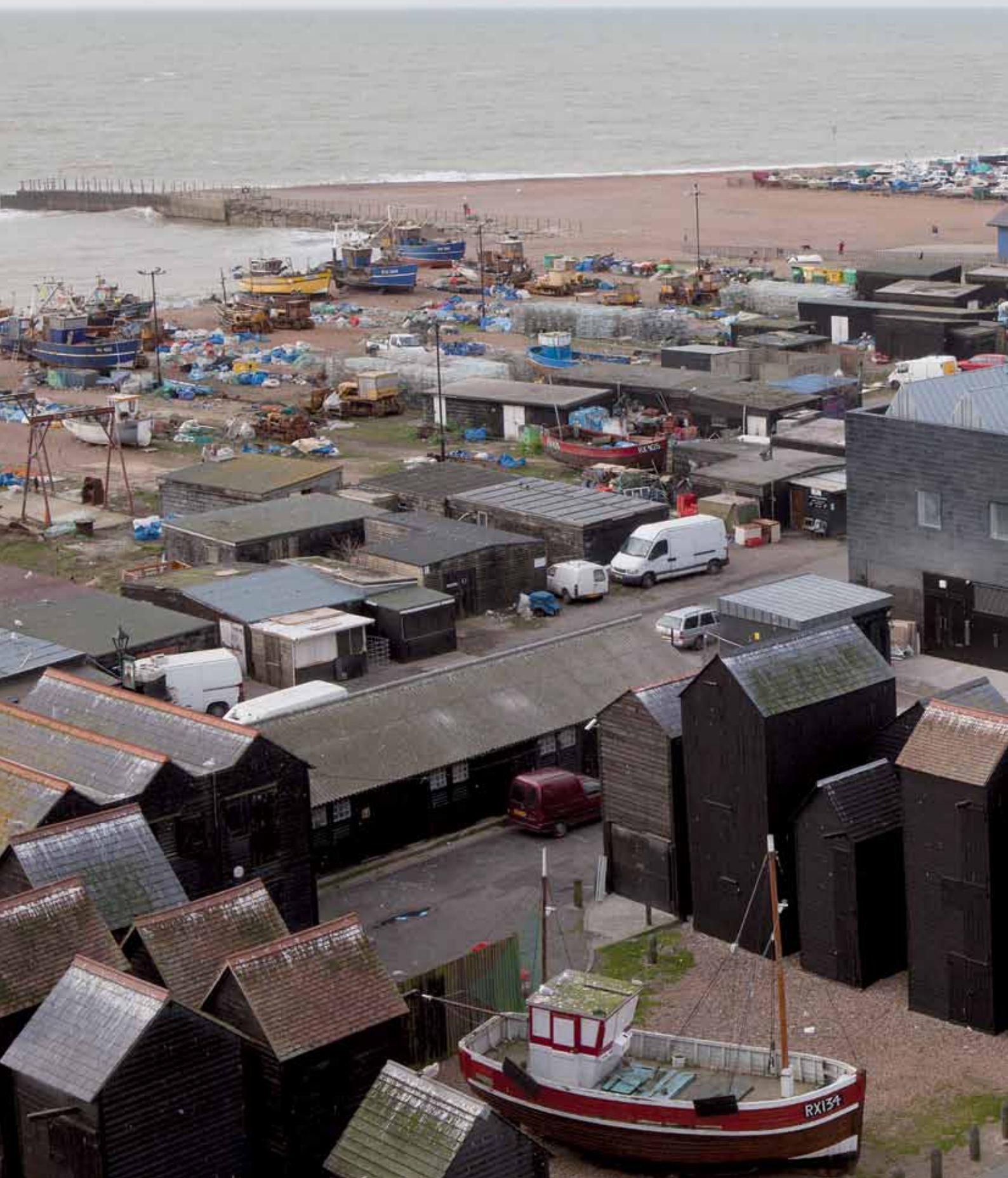
Jerwood Gallery