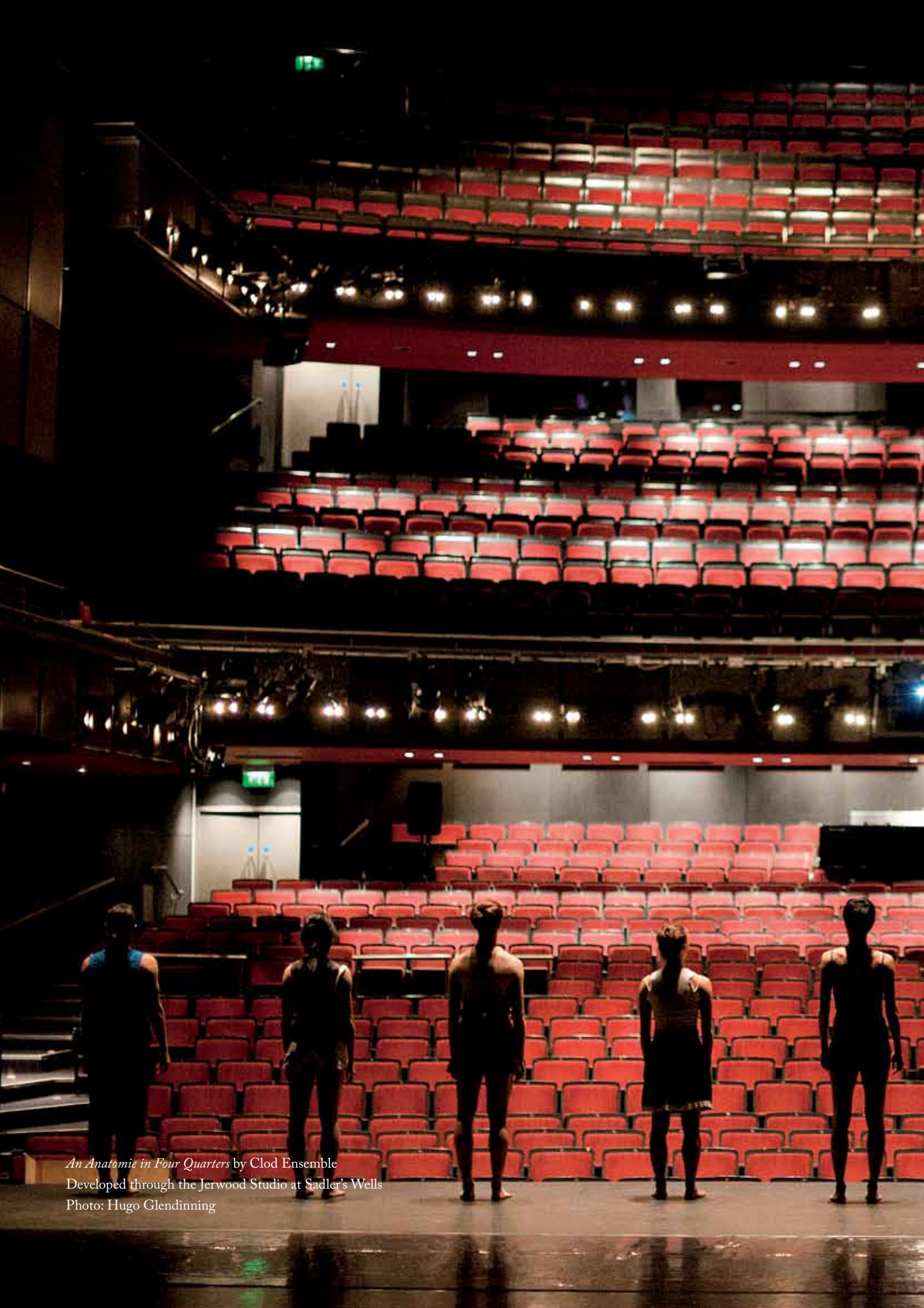
An Anatomie in Four Quarters by Clod Ensemble Developed through the Jerwood Studio at Sadler's Wells