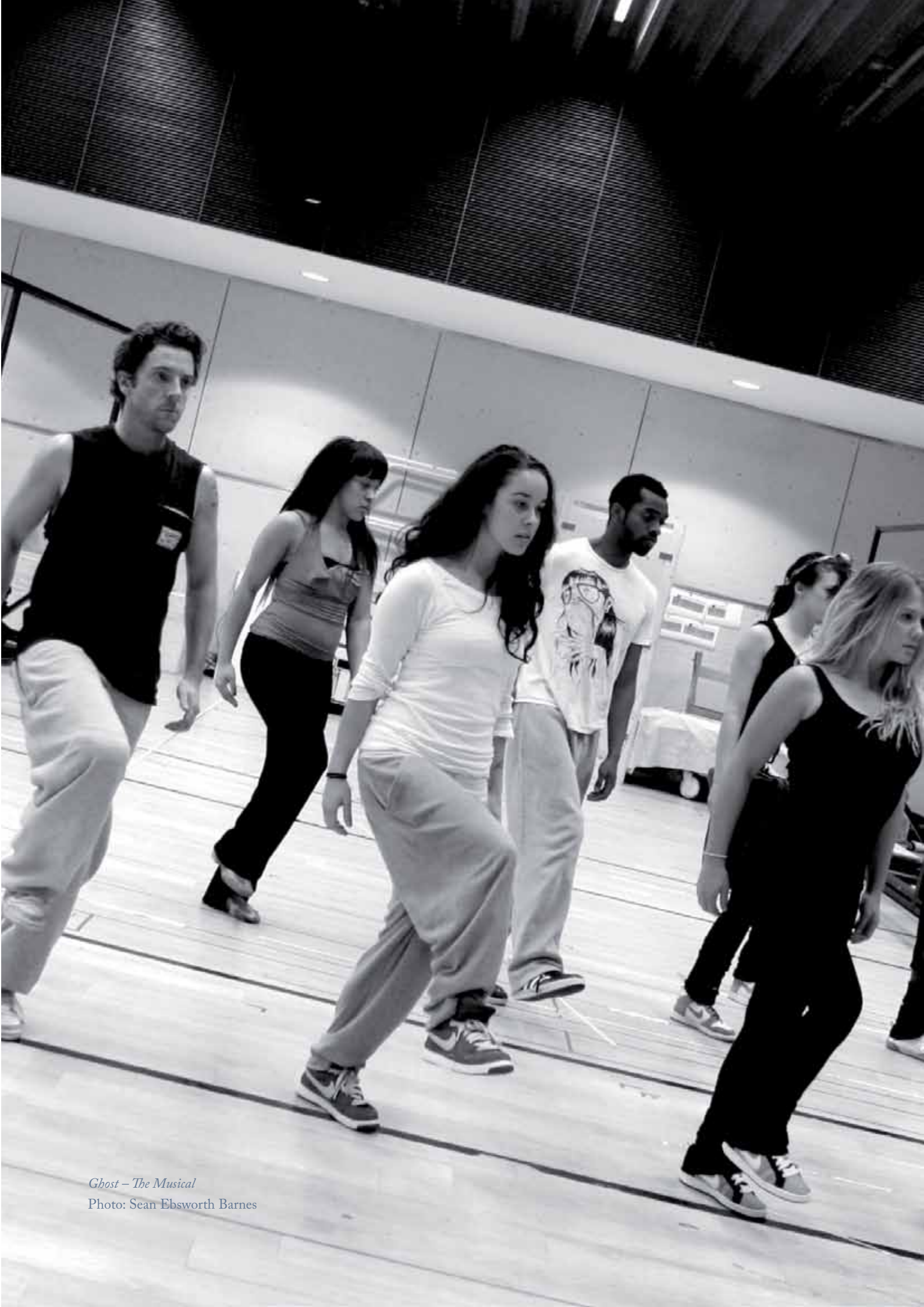
Ghost - The Musical