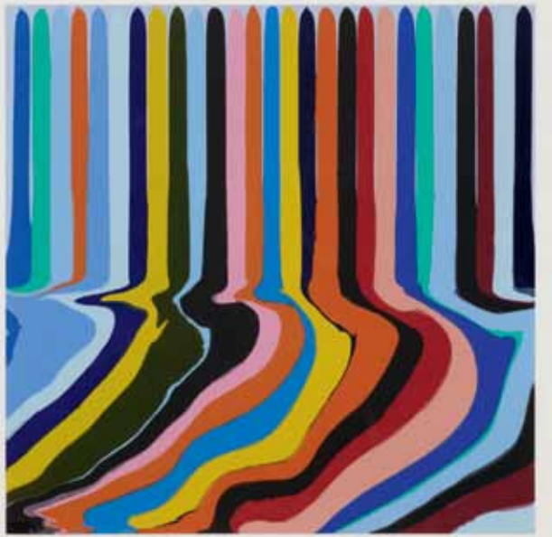
Ian Davenport, Colourplan Series Etchings ( Royal Blue Etching , Bright Red Etching , Citric Etching , Azure Blue Etching ), 2011