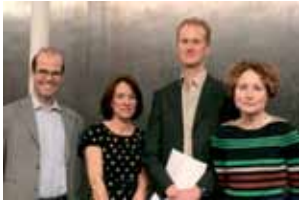
Winners of the 2011 Royal Society of Literature Jerwood Award for Non-Fiction Announced at Jerwood Space February 2012