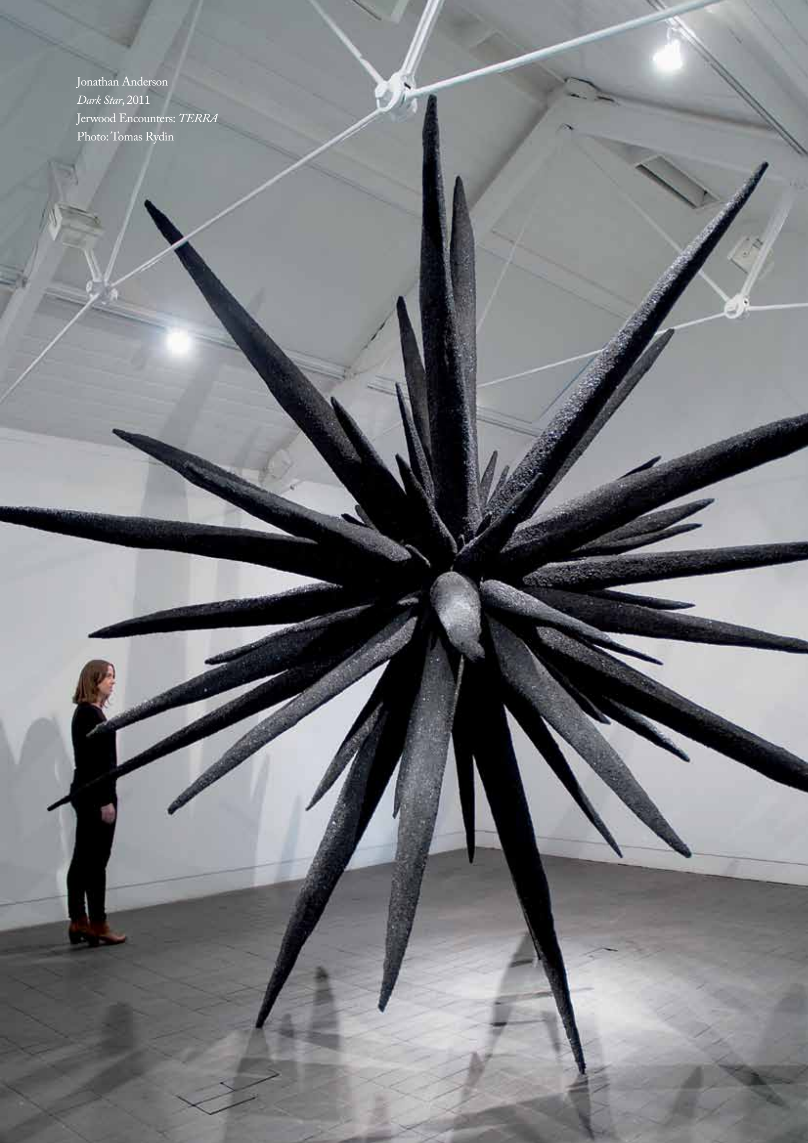
Jonathan Anderson Dark Star , 2011 Jerwood Encounters: TERRA