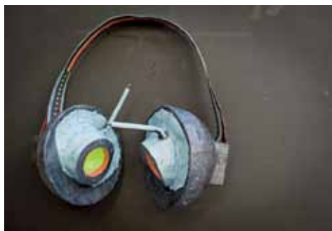
Lottie Jackson-Eeles Imagery Imaginary – Volume 1 (detail), 2010 Jerwood Drawing Prize