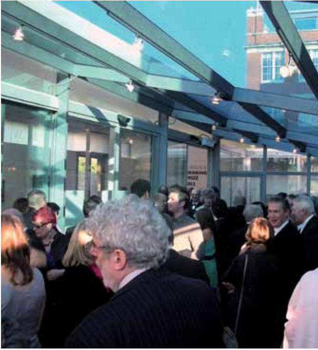
Above: Jerwood Drawing Prize 2011 Private View

Kevin Spacey at the launch of Be Inspired