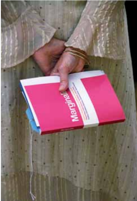
Jerwood/Arvon Mentoring Scheme Anthology launch event Free Word Centre, London

These projects provide tailored opportunities for artists to develop their individual talents, supported by organisations whose nurturing approaches are central to their artistic missions.