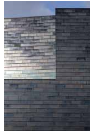
Jerwood Gallery Detail of the south facade